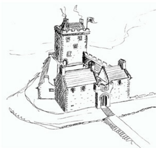
Appearance In 1600's

Toward Castle is visible from, and accessible from the road A-815, running south from Dunoon. Distance is about 9 miles.