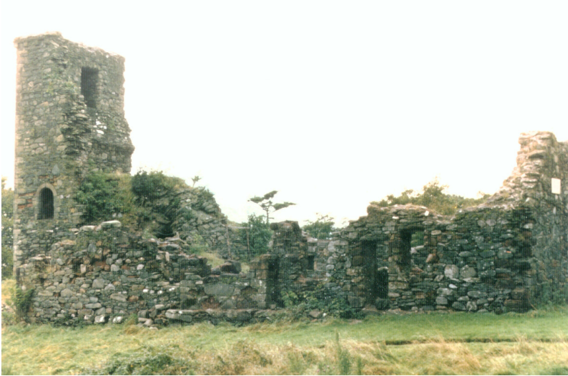
View from the East

Early castle of the Clan Chiefs. Built in the late 1400's by John VII, and originally of four stories. Visited by Queen Mary in July 1563. Located about 7 miles south of Dunoon. Note the many small stones in the wall construction. It was destroyed by the Campbells in 1646, resulting in the treacherous slaughter of 200 defenders. The Lamont Memorial in Dunoon commemorates that event